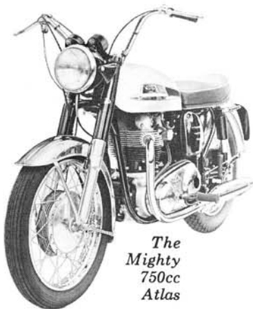
The Mighty 750cc Atlas

We ask you to visit a Norton dealer. Read some road tests before you go in. Ask the dealer questions. The more you know about the Norton, the more you'll like the Norton.