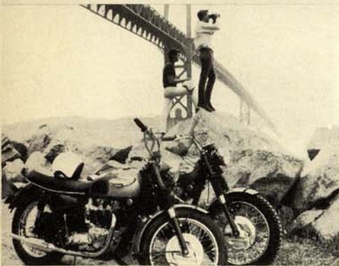
The Big Ride begins with a Triumph.

Bonneville, 650 c.c.'s of pent-up excitement.