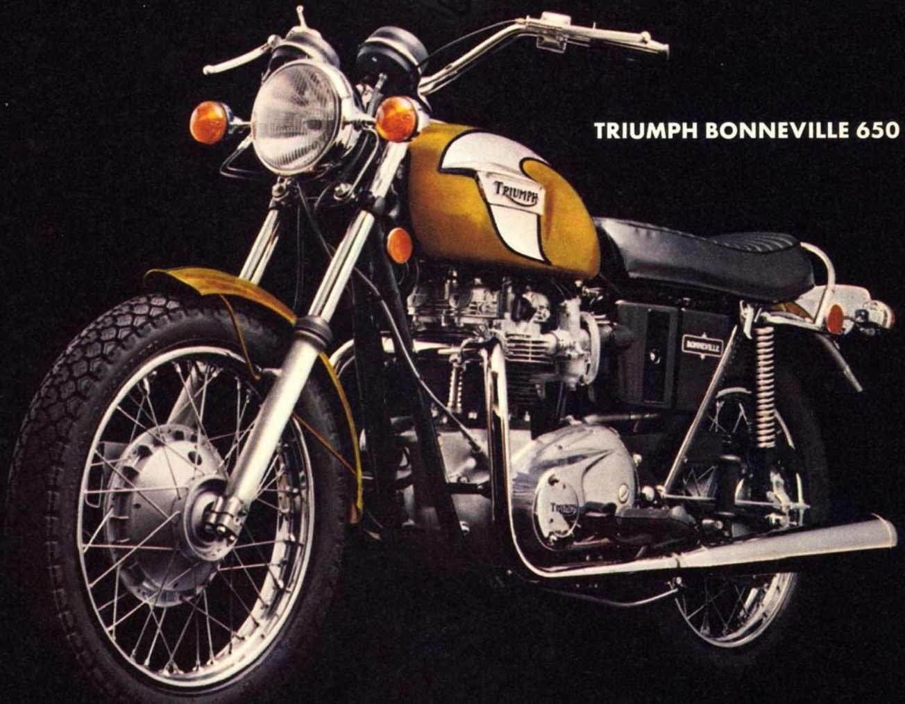
TRIUMPH BONNEVILLE 650